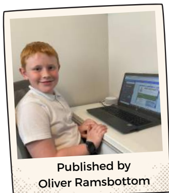
Published by Oliver Ramsbottom